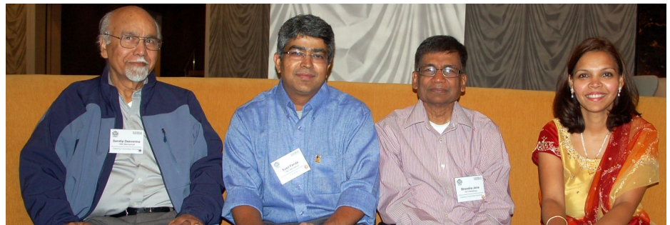
Our Executive Committee (from left to right: President, Treasurer, Vice President & Secretary)